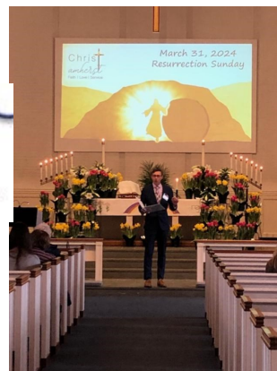
Easter at CUMC 2024 Choir with children Introduction of the chimes