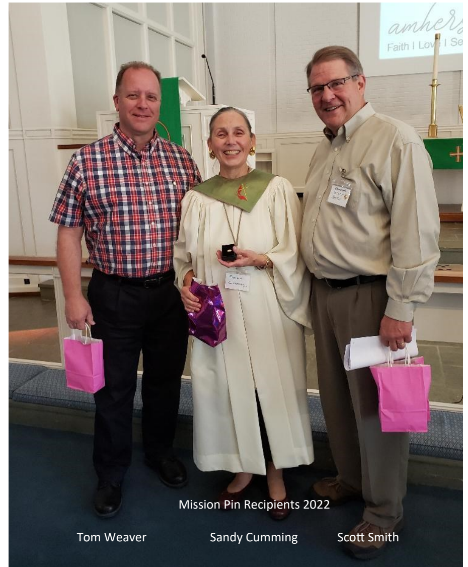
Mission Pin Recipients 2022