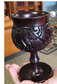
Handcrafted chalice brought from Uganda for CUMC