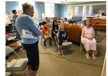
Sunday, September 18, 2022