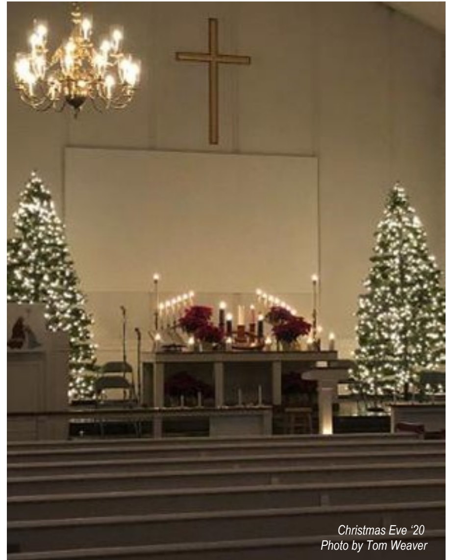
Christmas Eve '20