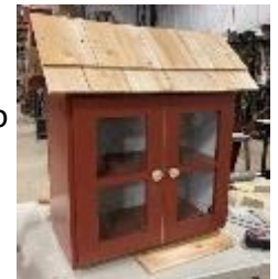
Work in progress

We will keep you informed of upcoming developments and needs as they occur.