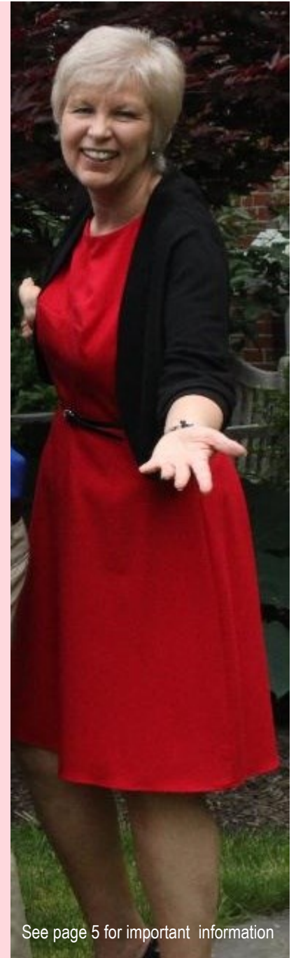
See page 5 for important information