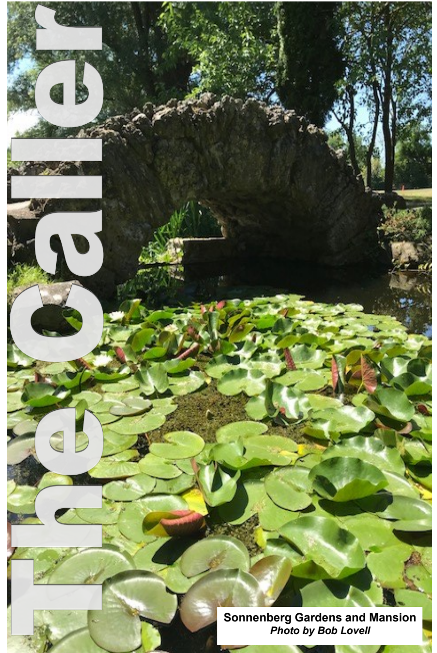
Sonnenberg Gardens and Mansion