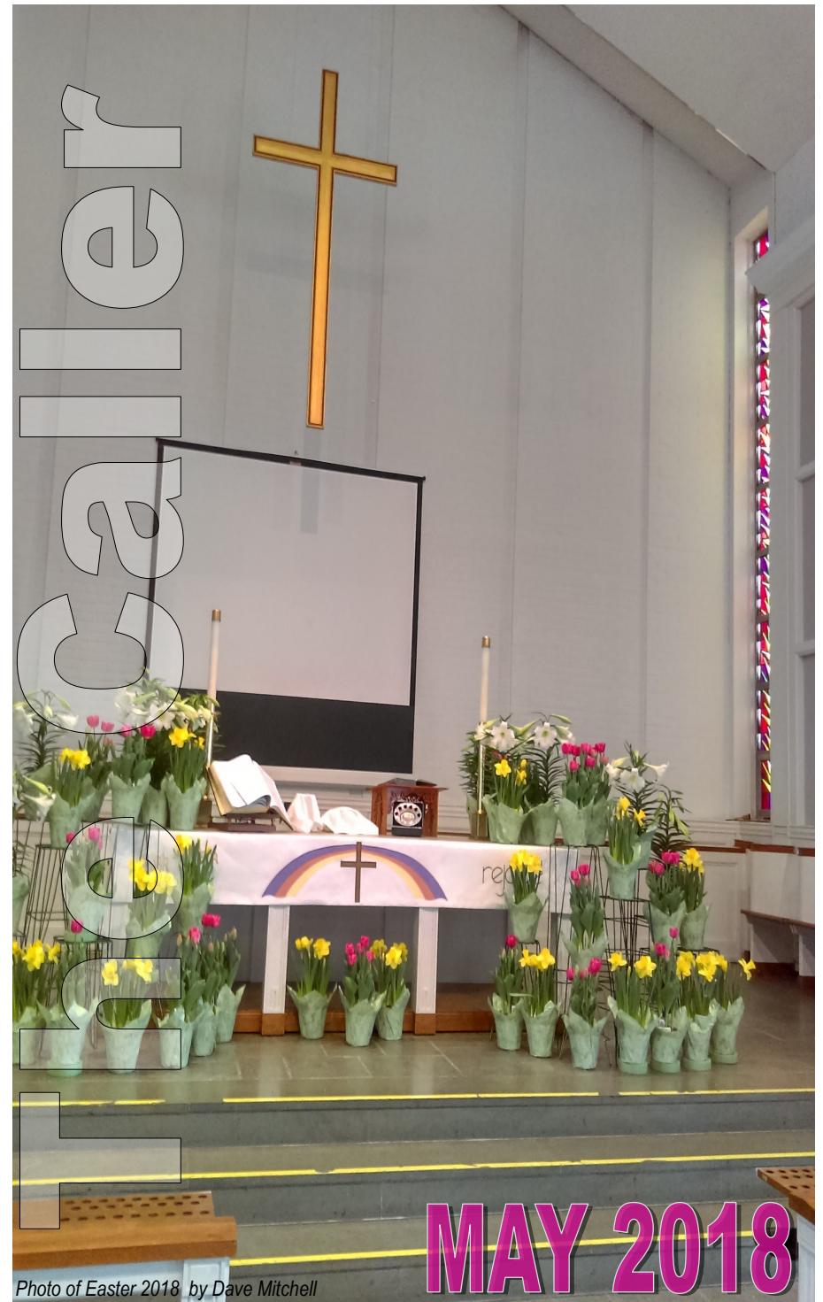
Photo of Easter 2018