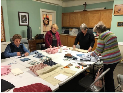
Crafting for a Cause