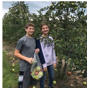
Community Youth Group Pumpkin and Apple Picking