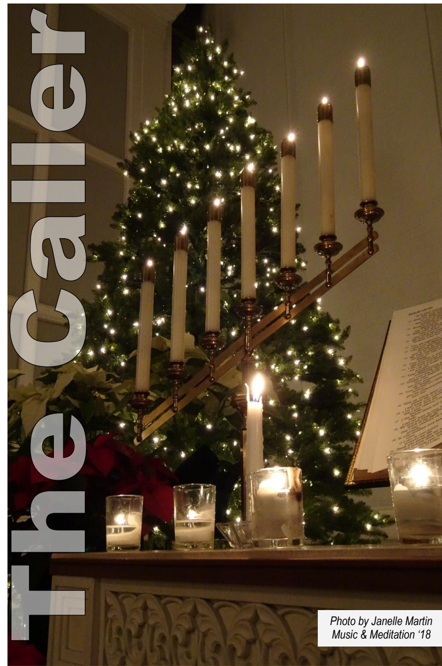
Music & Meditation '18