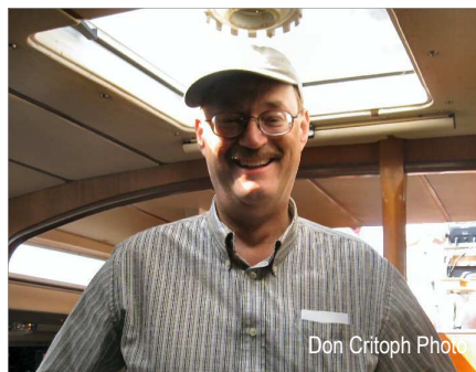
Don Critoph Photo